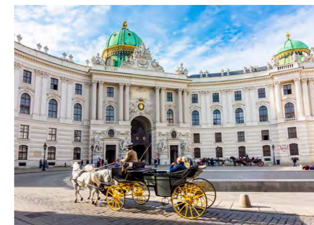
HABSBURG PALACE VIENNA

Arrive in Bratislava after lunch and explore the beautiful Slovak capital through a choice of excursions. How about a guided city tour with an introduction to Slovakian beer, a city hike with rewarding panoramic views, or a visit to the Danubiana Modern Art Museum—a Riverside favorite! After your busy and enriching day, return to the Riverside Mozart to relax and prepare for tomorrow's fun!